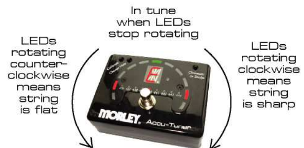
Diagram #2 Strobe Mode Tuning