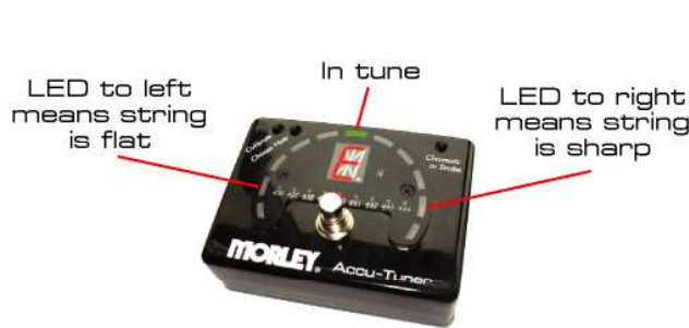
Diagram #1 Chromatic Mode Tuning

STROBE MODE TUNING: Again, pluck a string and let ring. In strobe mode, the LEDs rotate indicating flat (LEDs rotating counter-clockwise), sharp (LEDs rotating clockwise) or in tune (LEDs stop rotating and stay still). See diagram #2.