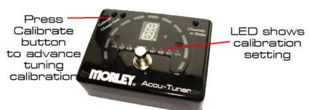
Diagram #4 Calibrate