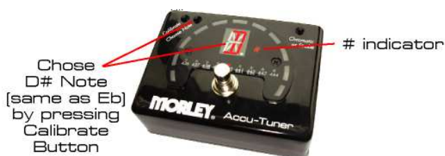
Diagram #3 Choose Note